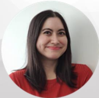
Myrna Study Abroad